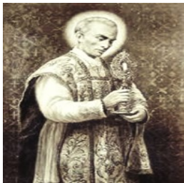
St. Peter Julian Eymard France ~ 1811-1868 Apostle of the Eucharist

“Go in spirit before the Tabernacle and place yourself in the Heart of Jesus. Unite yourself to the Masses which are being offered up at that moment, since there is not a minute of the day or night that the Holy Sacrifice is not being offered in some part of the world, and offer Jesus to the Heavenly Father, as a Victim, begging Him to pardon in His name, all sinners, particularly yourself, and ask Him to enkindle His love in all hearts to increase the number of Saints.”